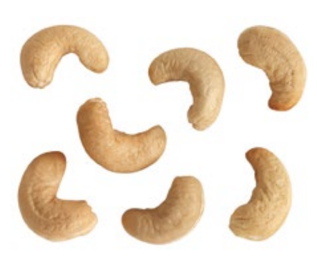
Class I - Scorched - LB - 450