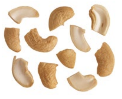
Scorched Large Pieces