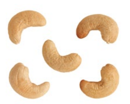
Class I - Scorched - LB - 320