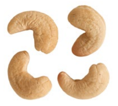
Class I - Scorched - LB - 240