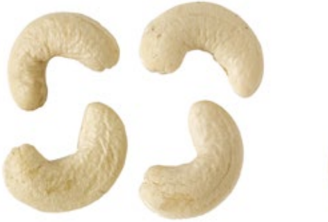
Extra - White - 210