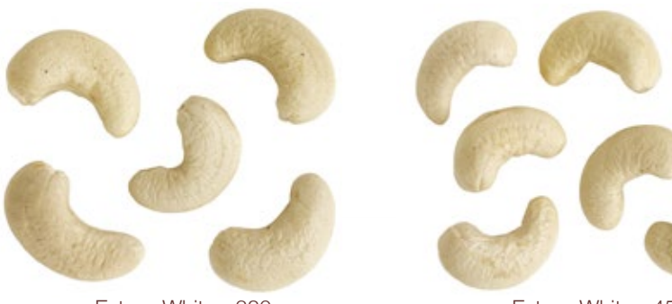
Extra - White - 320