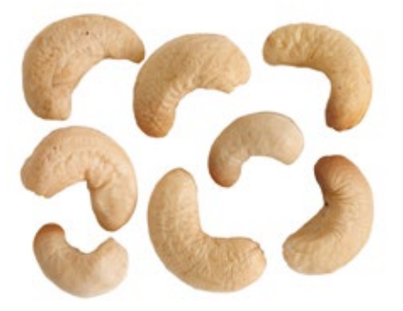
Class I - Scorched - LB