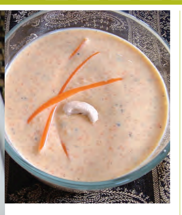
This recipe is delicious if spread on pita bread. It can also serve as a dipping sauce for vegetables or served with starters