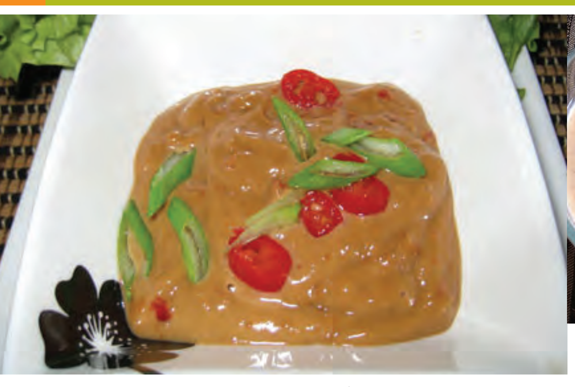
This dip particularly goes well with hot or cold fish (cod, hake and crab)

By Societe de Commercialisation de Produits Locaux (SCPL) in Ziguinchor, Senegal