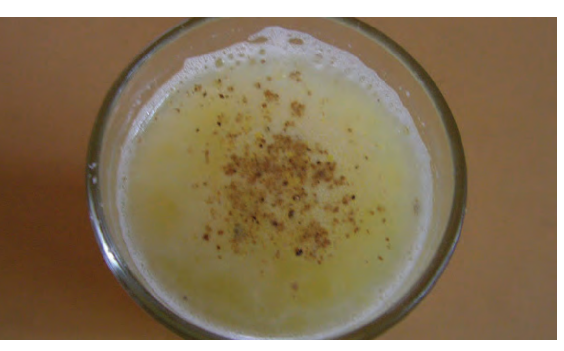
This juice tastes great, and is simple enough to prepare and has numerous health and nutritional benefits.