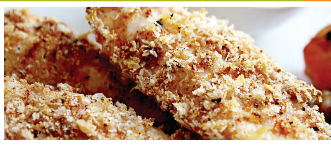
Chicken breasts dipped in an apricot and mustard sauce, then rolled in chopped cashew nuts for a wonderfully tangy, crunchy and easy-to-make chicken dish.