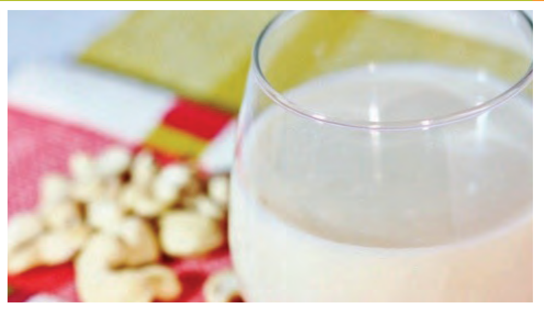
Cashew milk is an excellent alternative to dairy milk, especially for people who are lactose intolerant. It is great with tea, coffee and cereals.