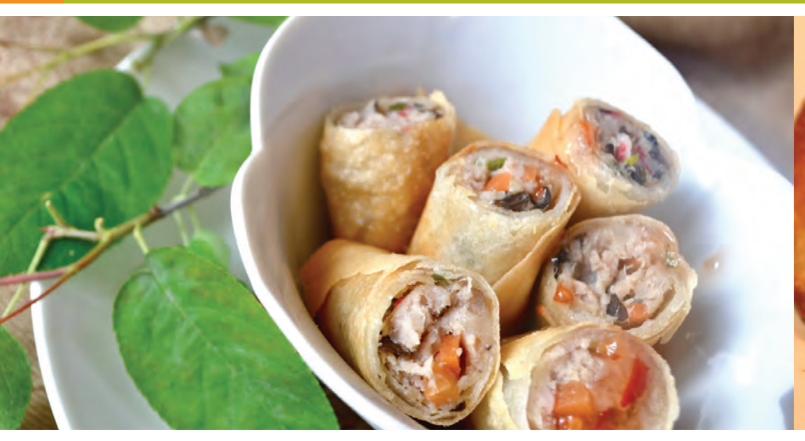
This is a light and easy to make snack, ideal for lunch or for starters at dinner