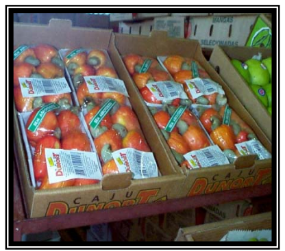
Cashew apples are displayed in open cardboard boxes of five of such trays (about 1.7kg)