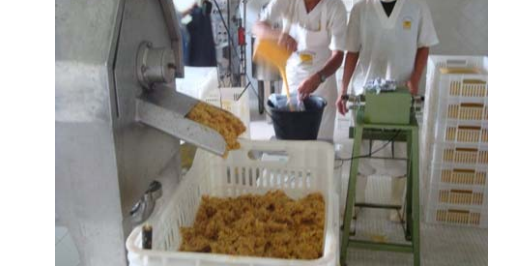
Cashew apple waste